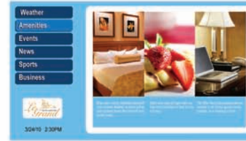
Hotel Amenities Billboard