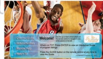
Portal - Welcome Page