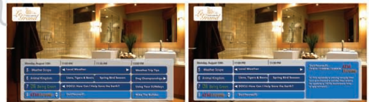
Electronic Program Guide (1 day, 3 day, or 5 day selections)