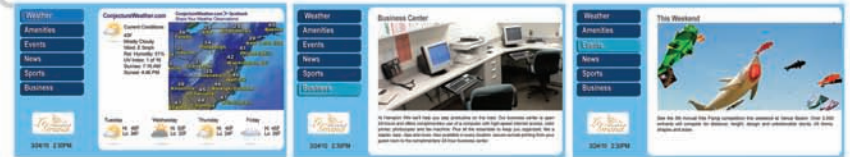
5 - Customizable Billboard Menu Selections