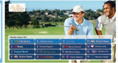
Channel Selection Guide